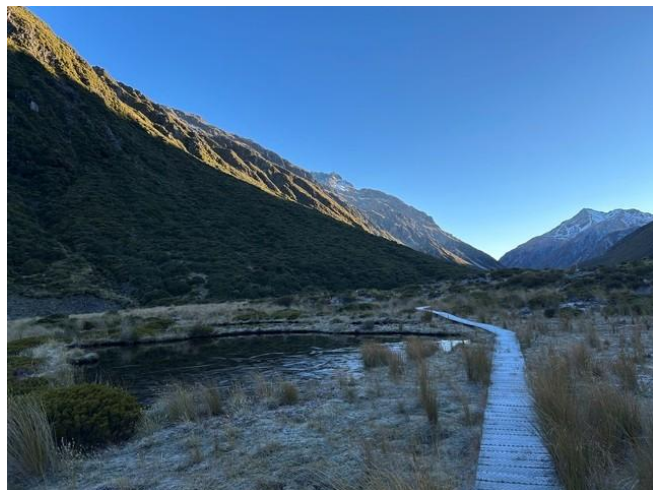
Ice on the tarns near the hut.