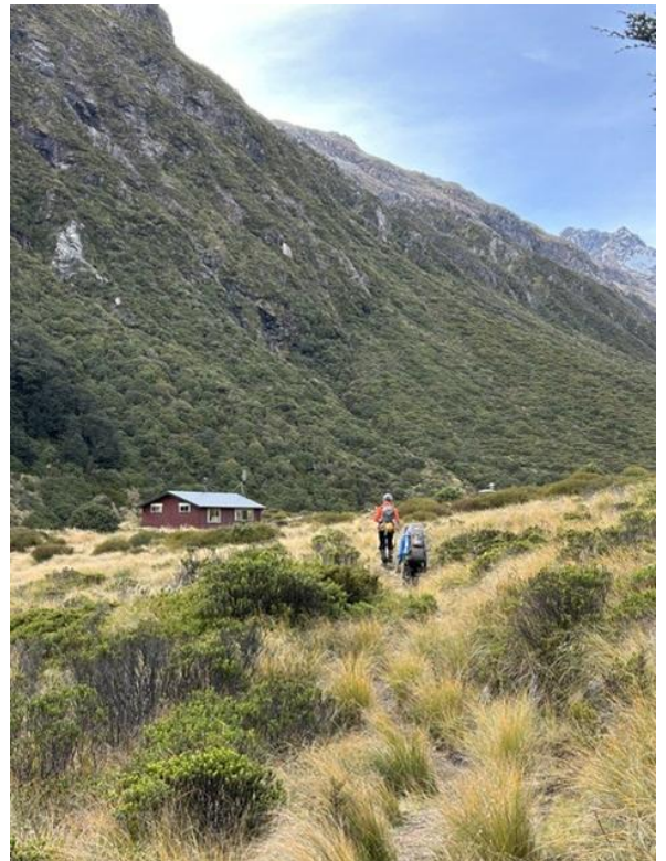
Arriving at the hut