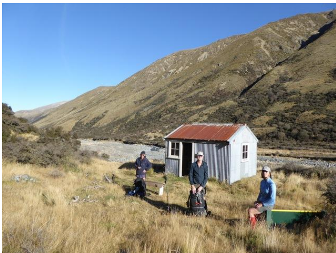
Tribulation Hut HH

We arrived at the 6 bunk hut to find we had it to ourselves. It is a nice enough hut but not a warm one. With only matagouri around us there was little wood to be gathered so we elected not to light the fire and to leave the small amount of wood for people arriving in the rain. After dinner, dessert and a game of monopoly cards we opted for our sleeping bags to keep warm. The night was chilly and there was frost on the windows in the morning (and some socks and boot laces were frozen solid) so we had a later start than intended. The sun was just reaching the hut as we left it and though the first few river crossings were not pleasant the sun quickly warmed us so that by the time we reached tribulation hut an hour later we were warm enough to remove long johns and several layers.