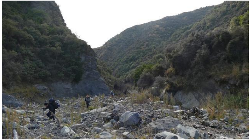
River Travel KH

The next section to Tribulation hut was all in open country and we covered the ground more quickly.