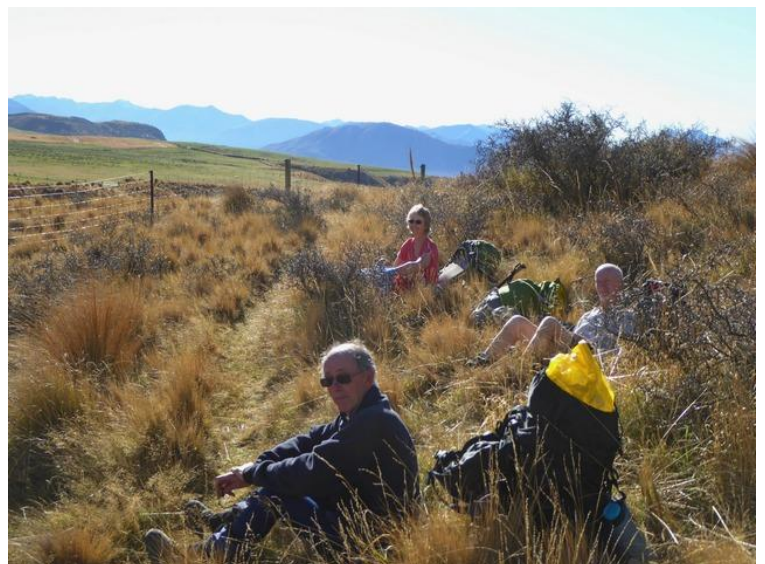
Lunch Stop HH