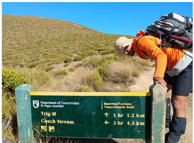
Trig M up to the junction with the Trig M track. 20250316.03

Walking from the car park at the U bend on the Porters Pass Road at 9.20am the NW was already getting up. But it wasn't stopping the numbers of other people we encountered, both in Coach Stream and on the Trig M track from the Porters route. Further up we stopped for scroggin in the shelter of the bush edge on the side NW before the junction with the Trig M track.