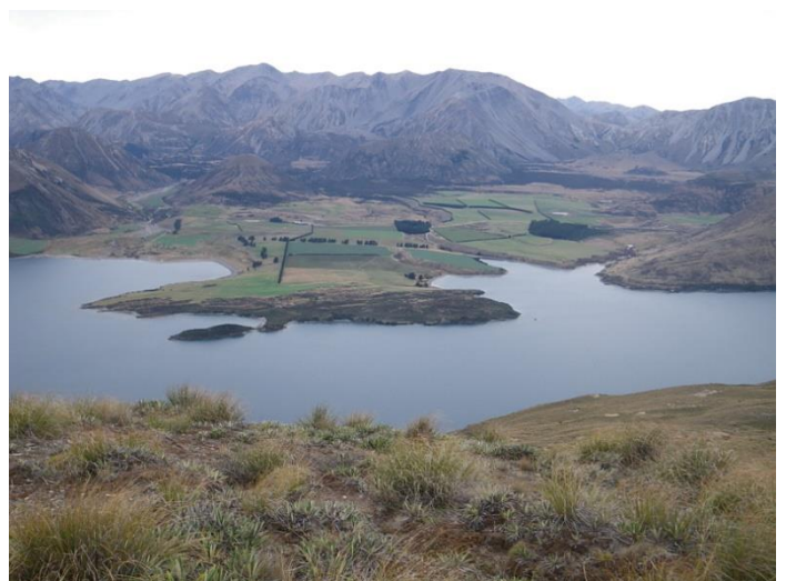
Peak Hill looking across to the Ryton River coming in on the left. 20250330-04