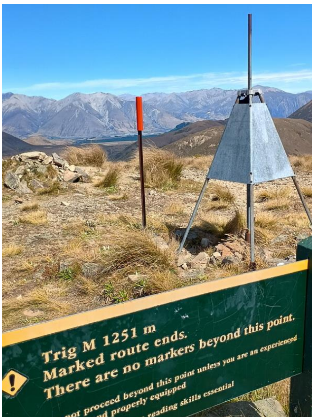
At Trig M and our sheltered lunch spot a little down to the east. 20250316.05

This was planned as Coach Stream along to Rabbit Hill but being at Trig M just before noon in a moderate NW we decided that lunch there in the shelter of a large Turpentine bush on the lee side was ideal and far enough.