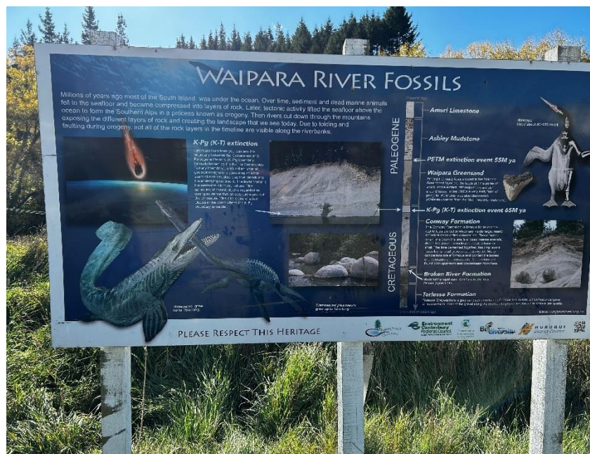
Information sign 20250412-01