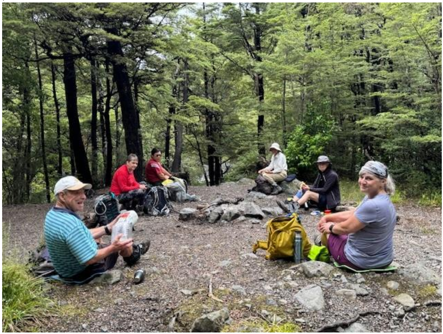
Our lunch spot