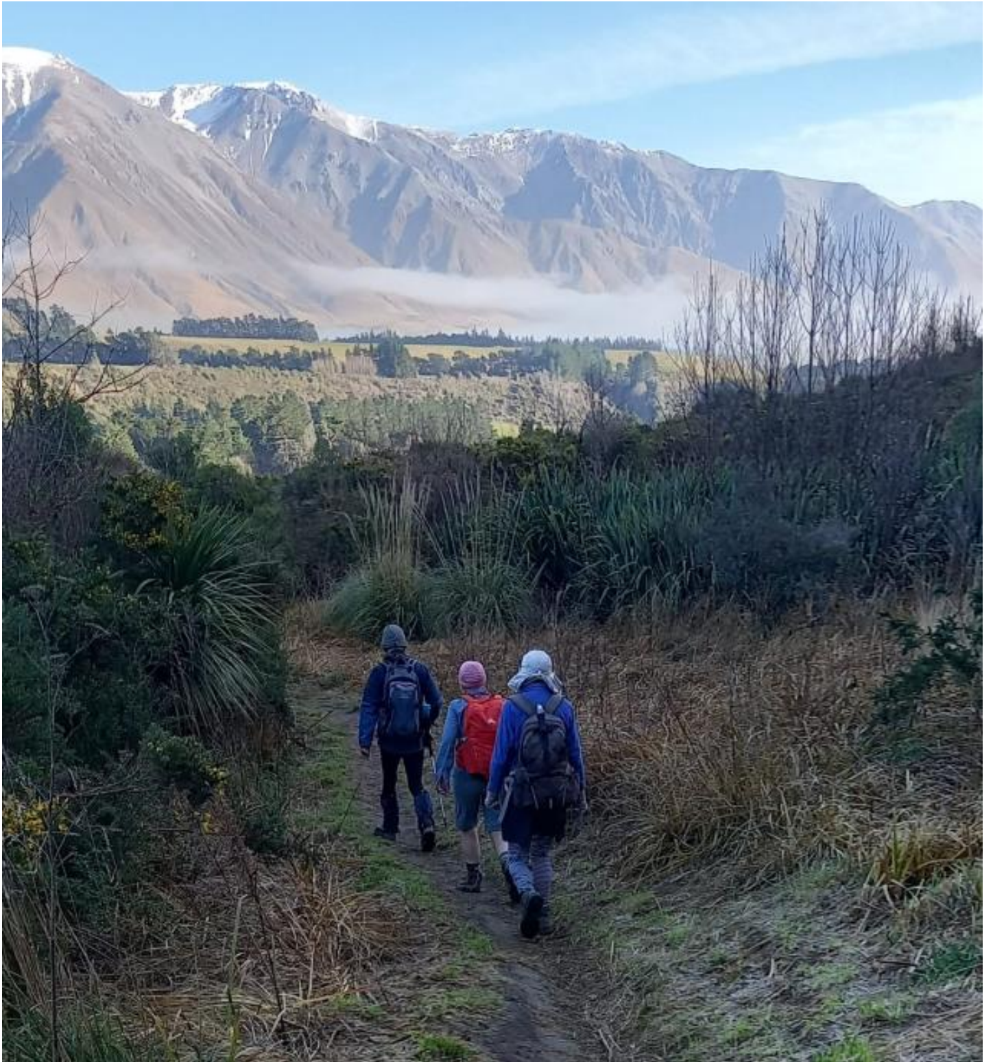
Mt Hutt Range comes into view