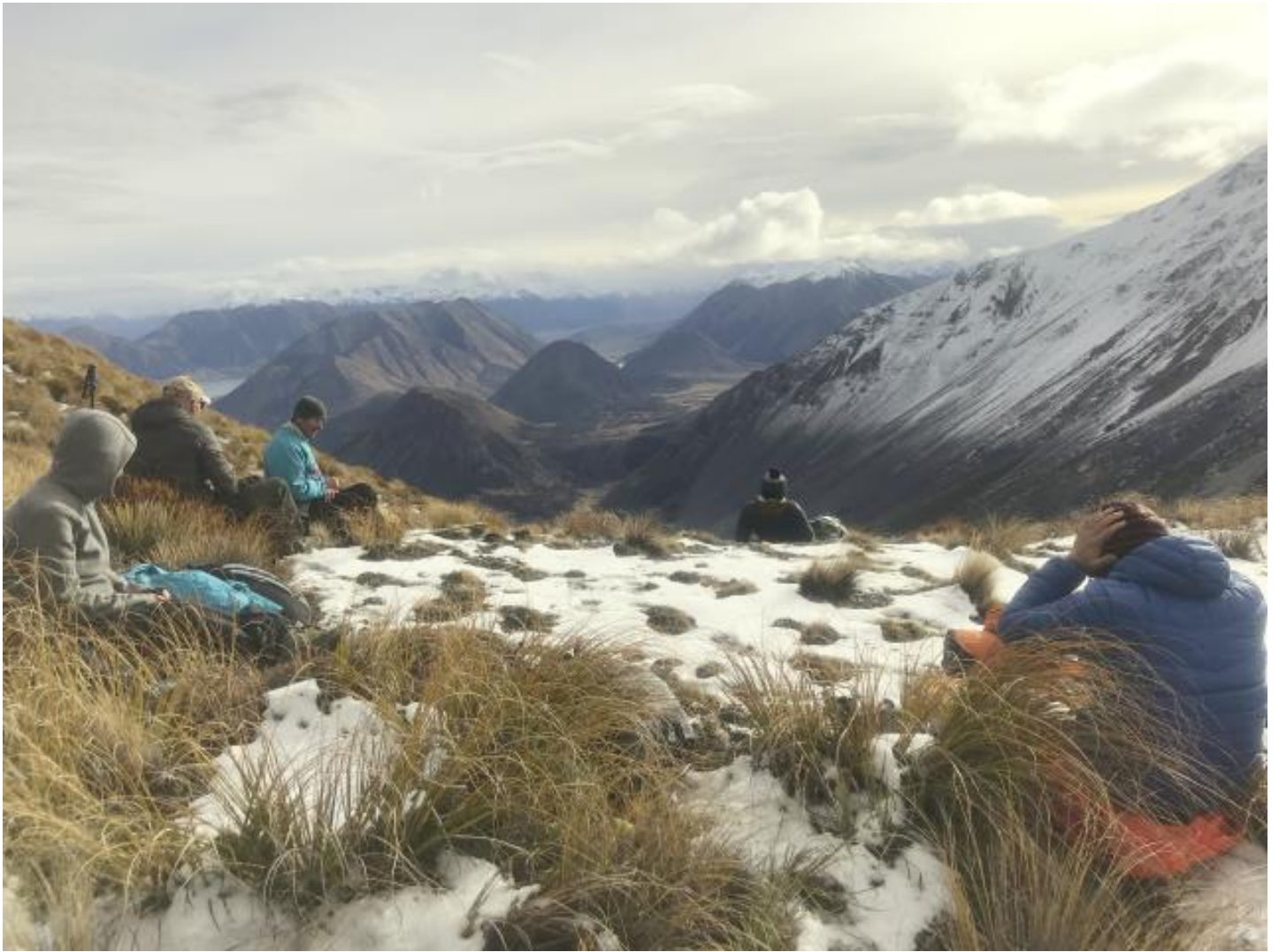
Our lunch spot