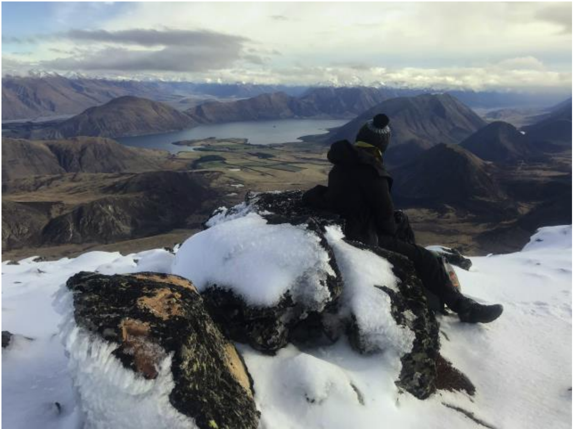
Lake Coleridge from Red Hill