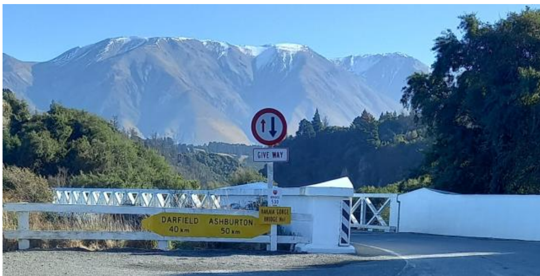
Rakaia Gorge Bridge. Our starting point