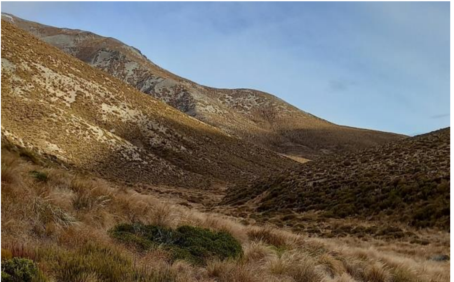
The spur from Coleridge Pass