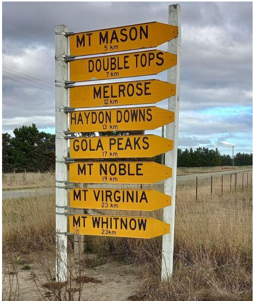
Hard to miss, aye?