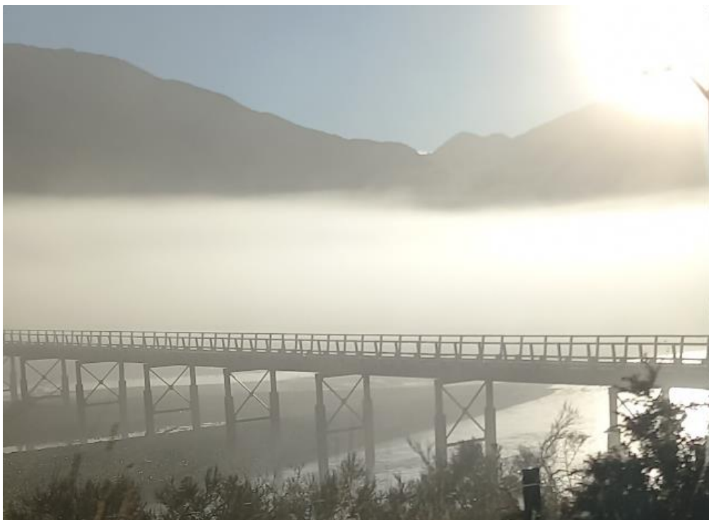
John snapped this from the car as we approached Mt White Bridge

A 7am start got us to Andrews Shelter on this frosty morning and walking a bit after 9am. The climb upwards through beech forest soon got us up to operating temperature. By lunchtime we were on a sunny, almost warm, Hallelujah Flat. Casey Saddle is not very conspicuous, but we noticed a slight change of slope angled towards the Poulter River and then some pronounced downslopes as we got back into forest. The stream flowing north from the saddle isn't Casey Stream but Surprise Stream. After just a few kilometres it shows as Casey Stream on the map. Walkers don't get to see much of it as the track goes high past point 869 to a useful spur. John and Derek waited for Wendy and Kerry at the old, pre 2015 Casey Hut site, then we walked a further twenty minutes to the new Casey Hut around the corner, well up from the Poulter River. It was 4.10pm, so we'd taken seven hours as predicted by the DoC sign at Andrews Shelter.