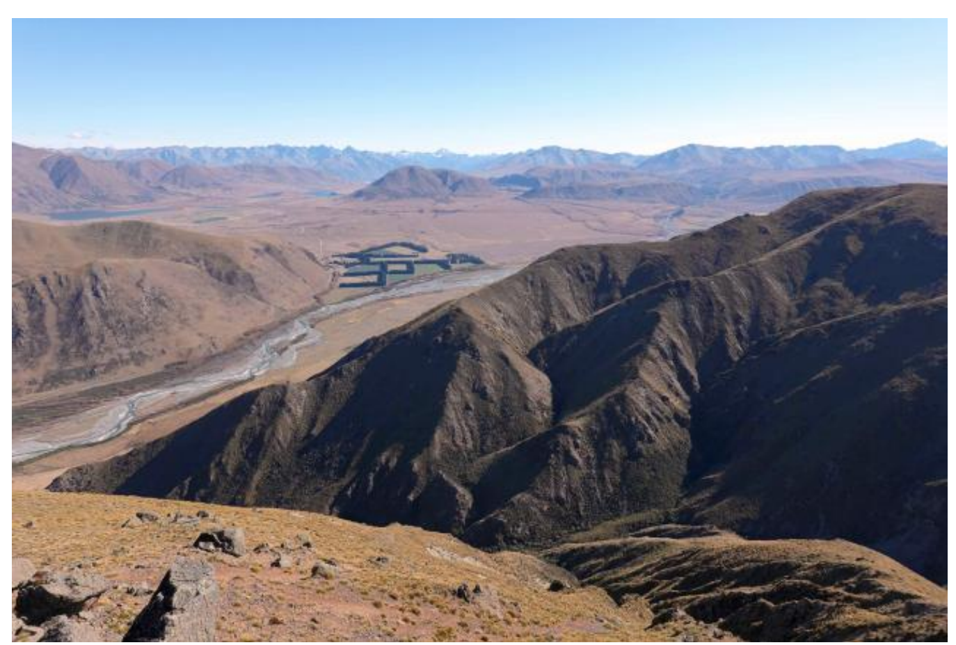
The view into the Hakatere Basin from Mt Barrosa

Ten turned up for a wonderful autumn day out on Mt Barrosa. After coffee at the Mt Somers store, we drove to the car-park near Blowing Point and headed up the well-trodden track, through dry grass to the spur leading to the summit. We straggled out, then regrouped at stops now and then and were on top by lunchtime. Barrosa Summit Cafe gave views of Mt D'Archiac to Mt Somers, with a floor decor of transparent and lightly coloured agates to tickle the palate.