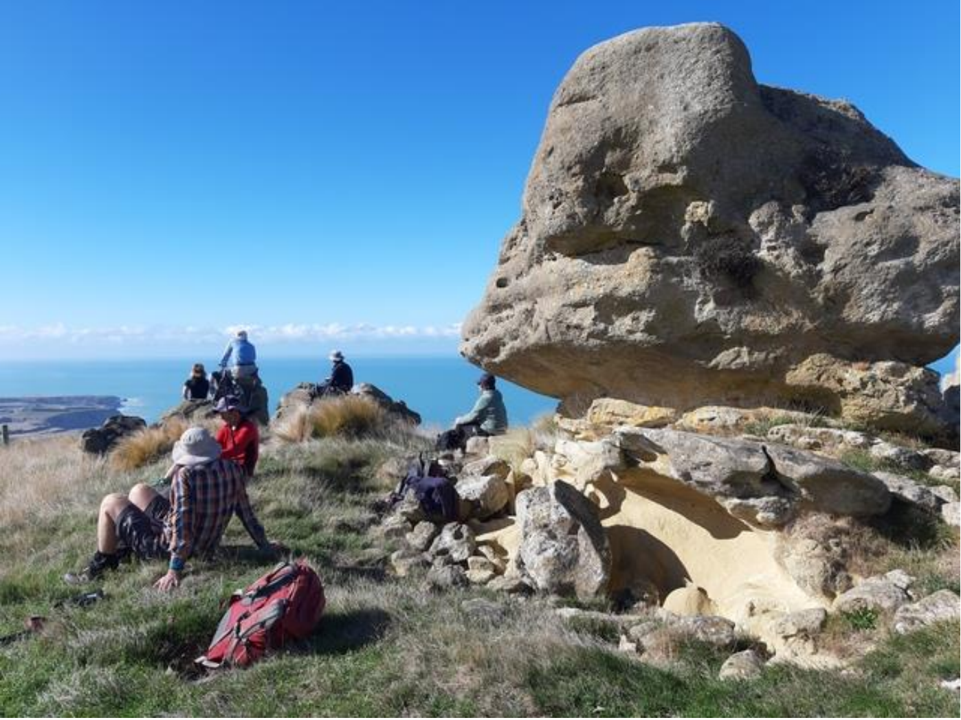
We gaze seaward