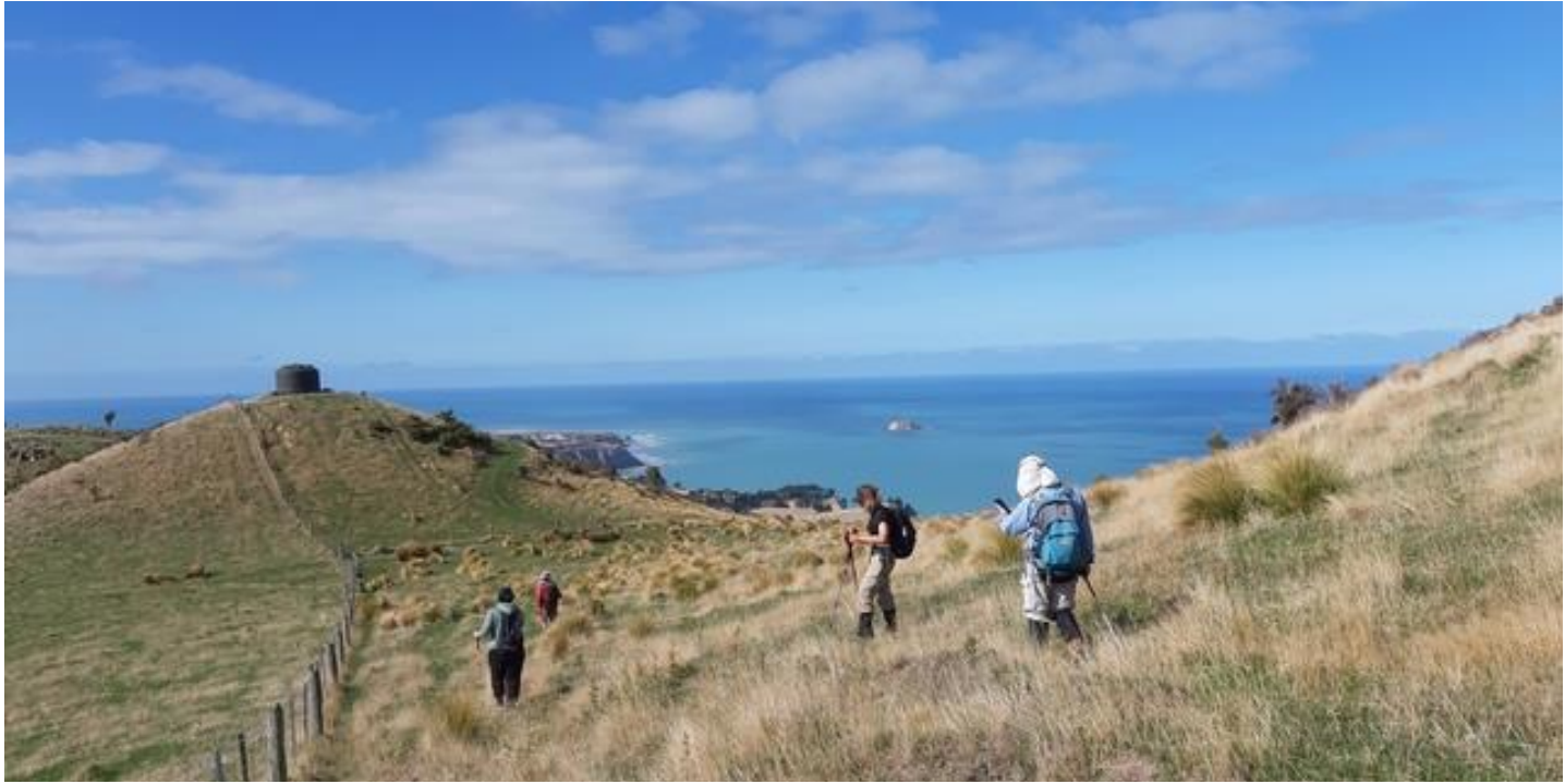
Tiny Motunau Island in view