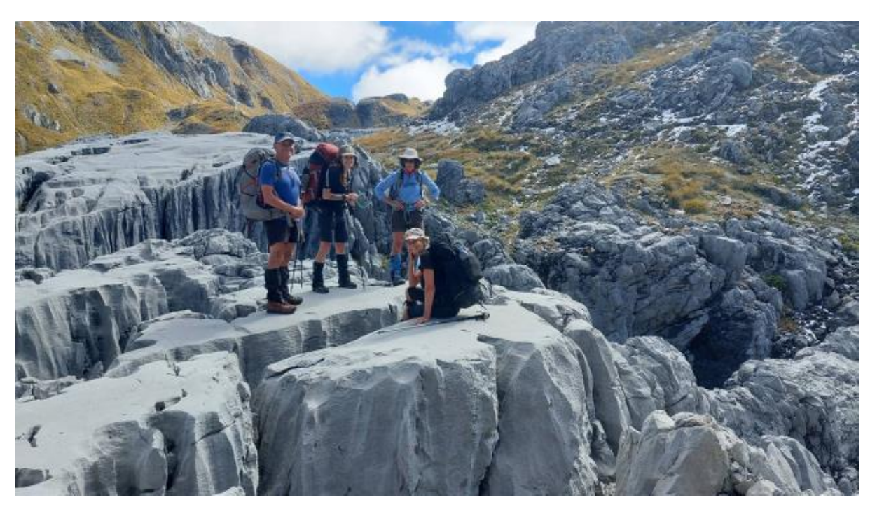
Replica Hill Saddle.

us the first of many "wow" moments that weekend, as vertical cliffs that almost surround the lake, appeared to glow. A pleasant evening was spent around a characteristic, Geoff campfire.