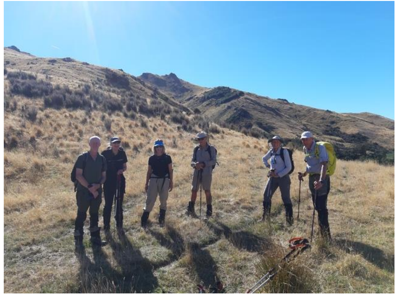
Our crew, with a craggy Virginia Peak behind