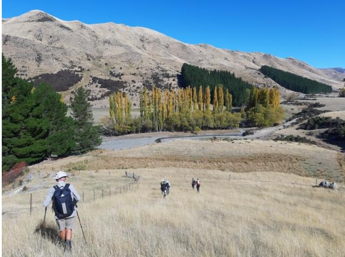
Pines, poplars and Dan stand out in this bleached landscape