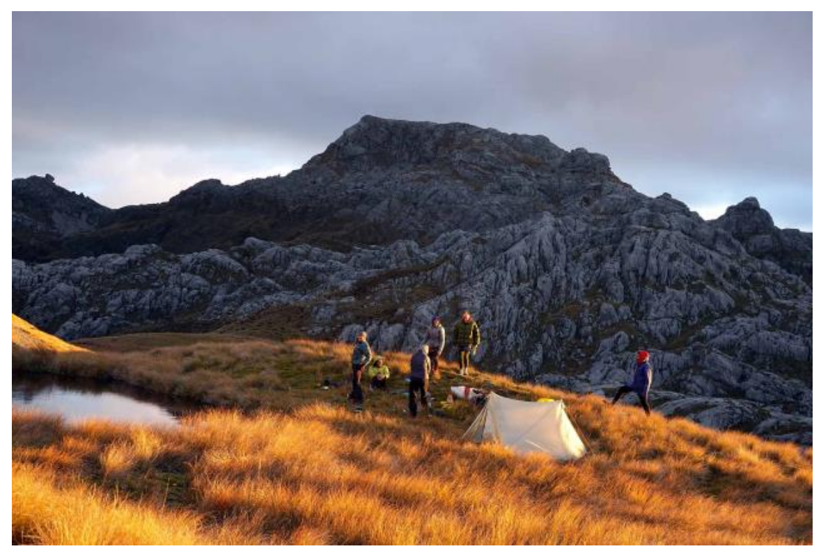
Sentinel Basin Camp.

We awoke to find ourselves above thick valley cloud, with only the highest peaks of the ranges to the west peeking through. A short side-trip further up Sunrise Ridge let us view an impossible-looking route ahead, so down we went, through the rock maze, along the tussock valley and down to Sunrise Peak, which was rapidly disappearing as the cloud level rose. A day-tramper appeared from below and we descended steep tussock slopes where he had appeared. Unfortunately, he had ascended several hundred metres away and turned towards us when he heard our voices in the mist. The difference was significant as we encountered a series of small bluffs with scant vegetation in places. Even spaniard plants were welcomed as handholds as we inched our way down. Finally, we reached easier terrain with snow-poles leading to the marked track at the bushline—time for another fire for a lunch-time brew. The track was steep but aching knees were treated to a refreshing swim on reaching the Owen River at the Bulmer Creek confluence, before the final walk back to the cars.