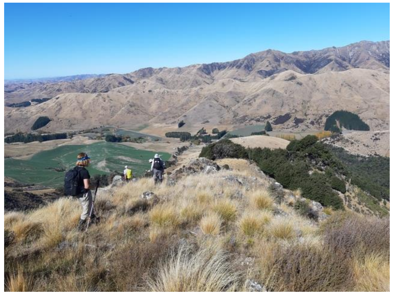
On the spur leading to Mt Whitnow Station