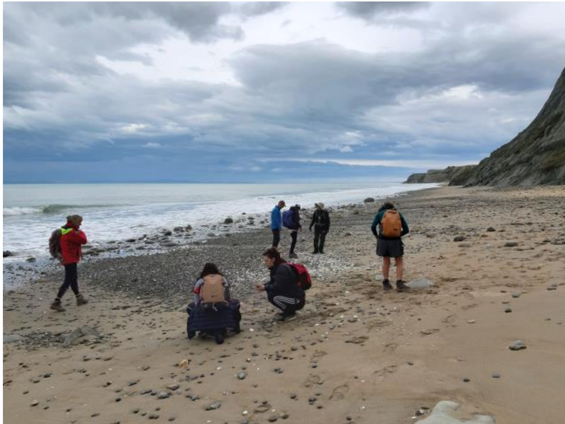
Feverishly fossil fossicking