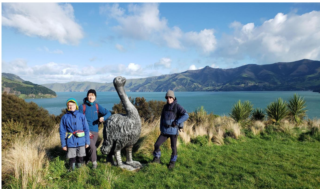
Trampers and friend

Four hardy souls turned up to drive to Akaroa for a walk from the town, around Childrens Bay Park. As we drove into the parking spot, we hit a nasty hail shower but luckily after that we managed to avoid any precipitation, until we got into the cars 5 hours later.