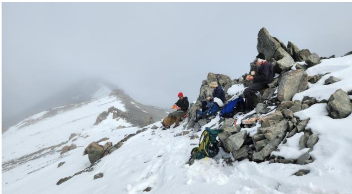
Lunchtime on the Craigieburn main ridge