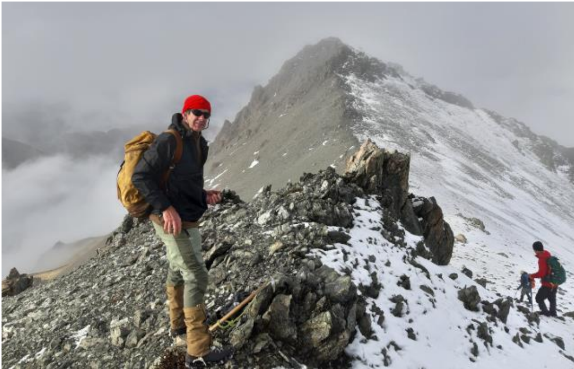
On the ridge leading to Mt Wall