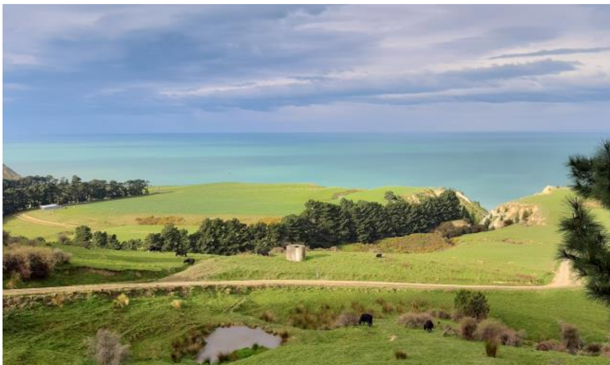
Farmland north of our circuit