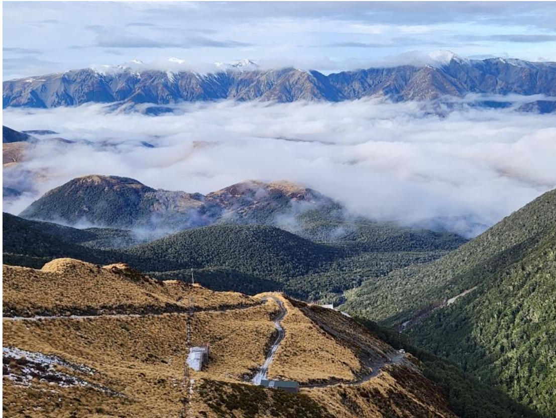
An almost snowless Broken River ski-field

road's locked gate and walk up the road, then the zip-zag track to the ski buildings. The field was severely lacking in snow as we walked beside the stationary, upper rope tow, then sidled to a spur that led to the ridge. Views were limited by mist as we sheltered in the lee of the ridge for lunch. Fresh drifts of powder snow on the ridge were avoided as we climbed to point 1884, higher than 1874m Mt Wall. Minimal snow on the very craggy ridge made our task harder as we turned SE to Mt Wall. In some places it was easier to get off the ridge and sidle. From Mt Wall we had good views, but mist further down made it harder to navigate the massive scree areas and know which gully to descend. Only one gully goes all the way to Broken River, the others peter out and run into beech forest. We reached Merv's car at 4:30 and arrived home to a dark, drizzly evening. We: Merv Meredith, Wang, Peter Umbers and Kerry Moore had a good, dry day out, inland, while Christchurch had a drizzly day. 🏔️ KM