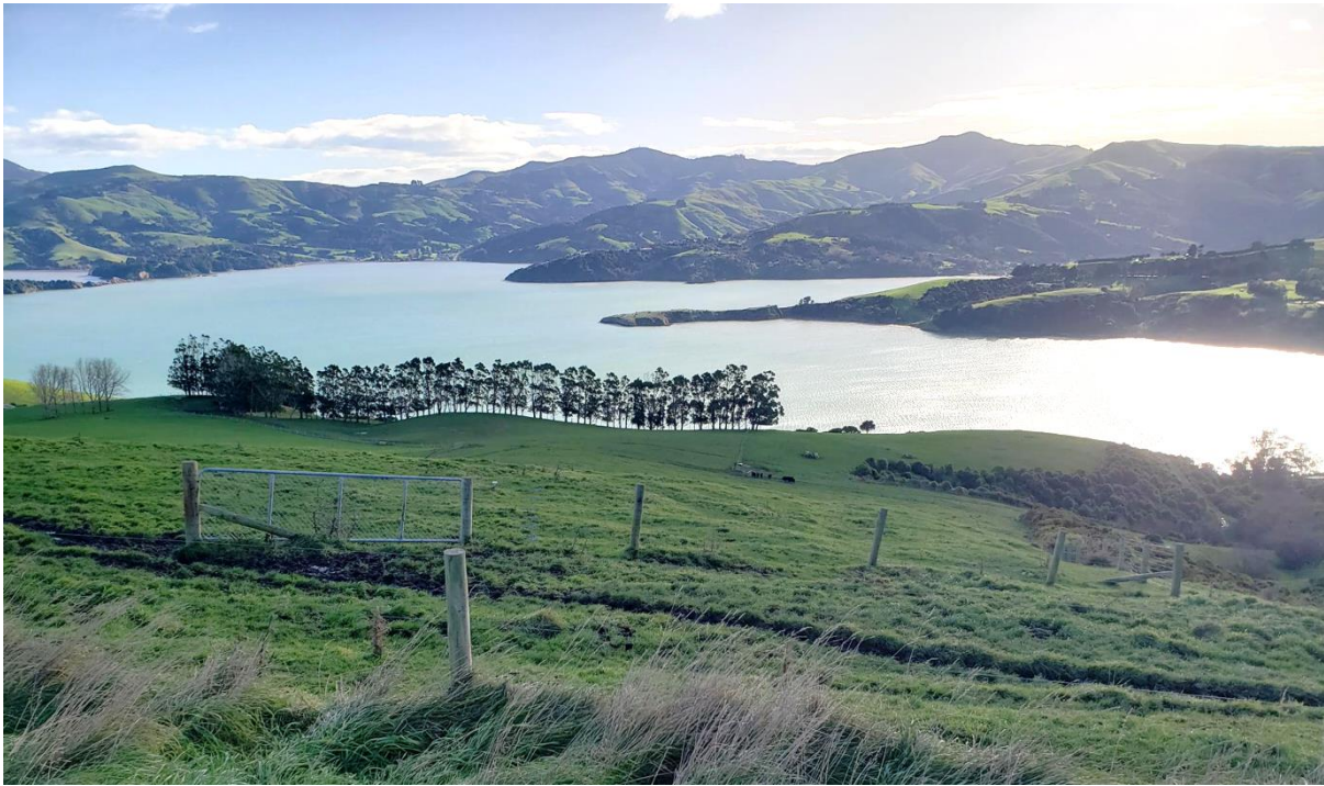
Akaroa Harbour looking north