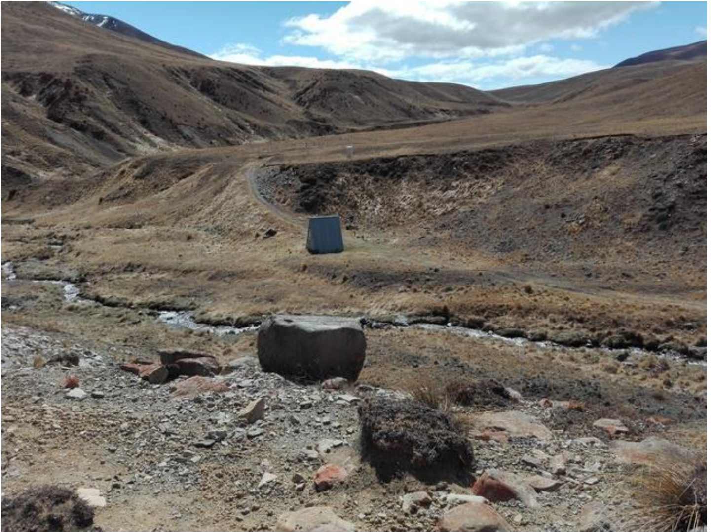
The A-frame hut