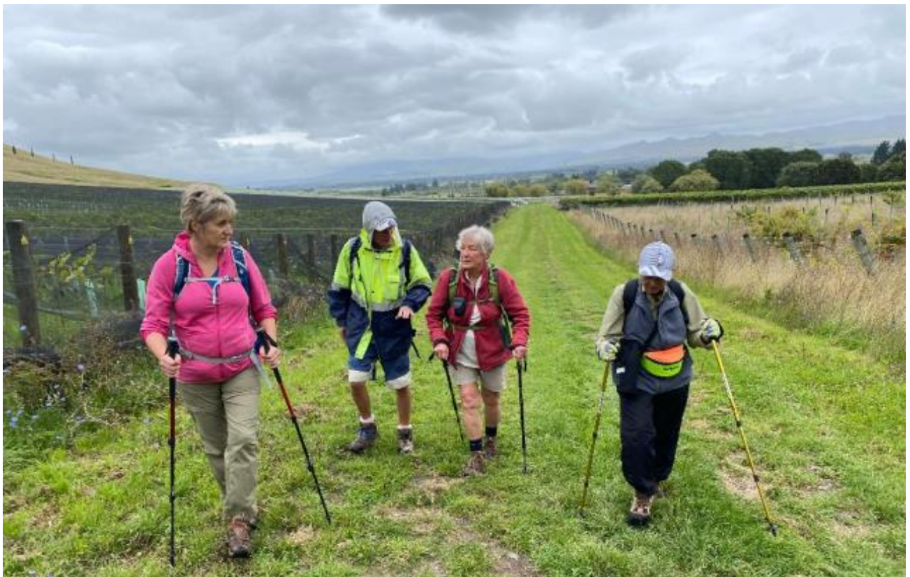
No need to walk in single-file on this track.