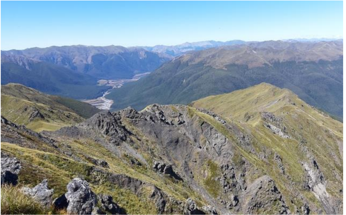
Looking to the junction of the Nina and Lewis Rivers with Boyle Village further on