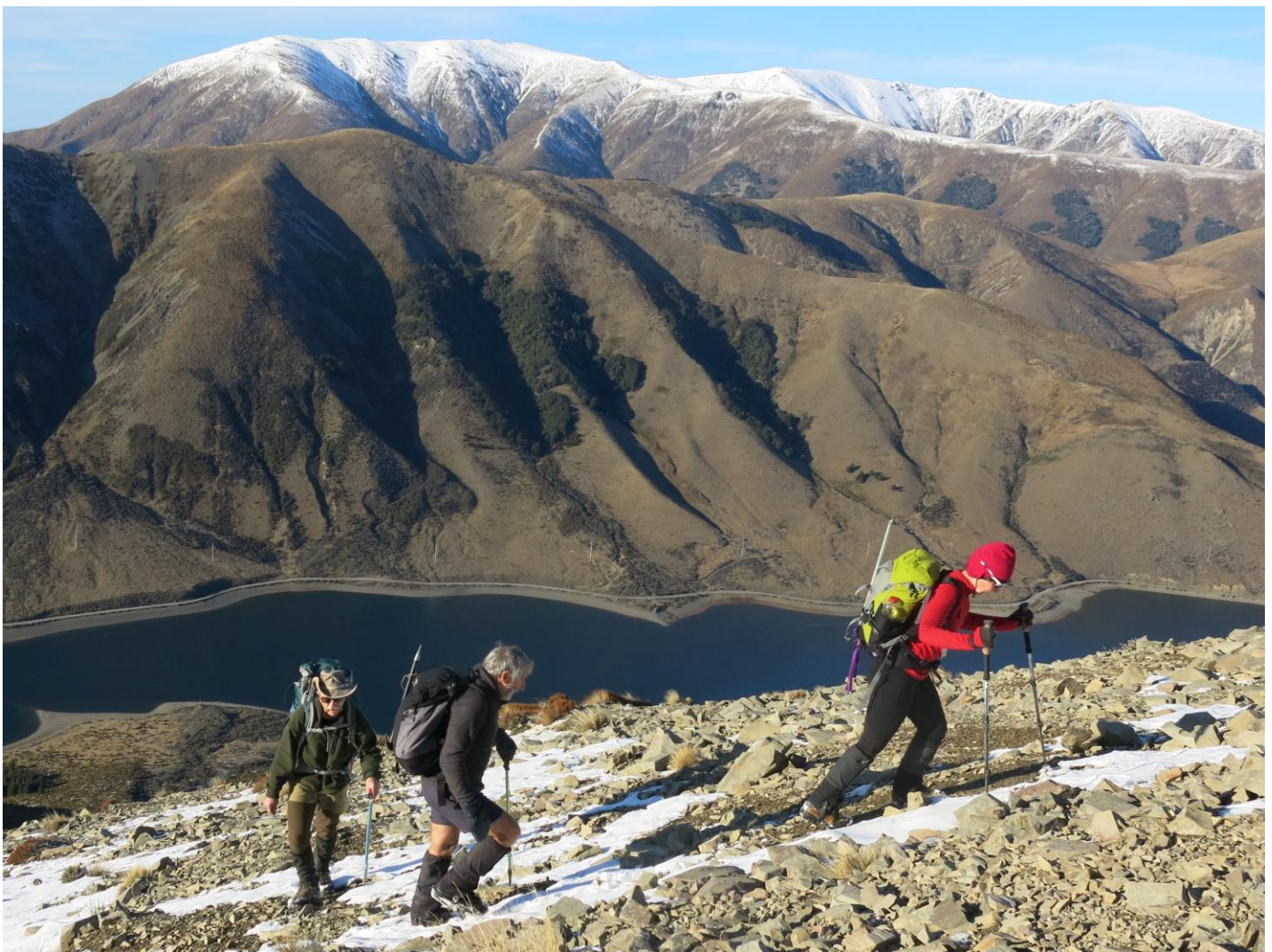
Figure 4. Ascending Mt. Lyndon. Lake Lyndon and Benmore Range in the background.

We were: Raymond Ford (leader), Bill Templeton , Geoff Spearpoint , Jane Liddle 🏔️ JL