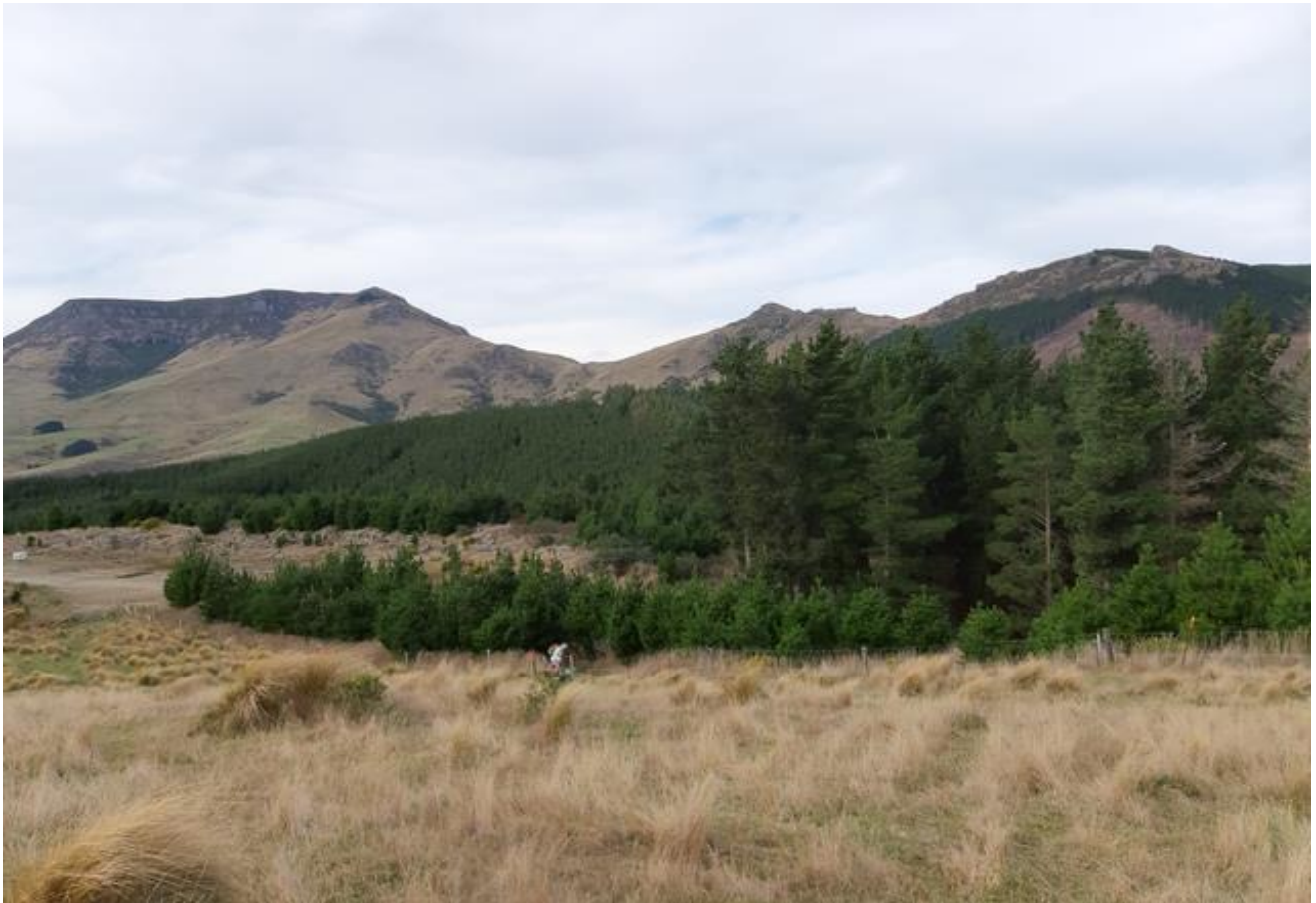
Figure 3 Young pines and old pines. Looking towards Packhorse Hut in the saddle and flat topped Mt Bradley.