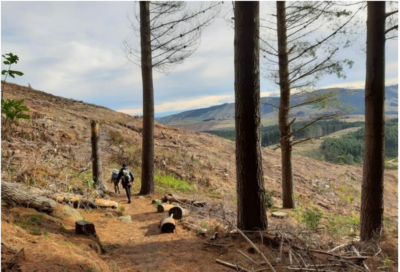
Figure 2 Entering the wasteland.