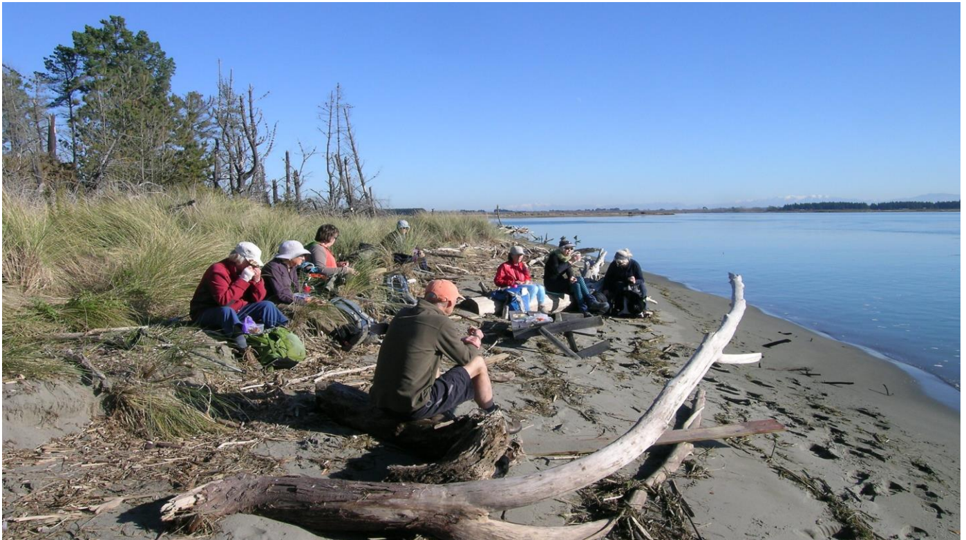
Figure 1 Brooklands Lagoon.