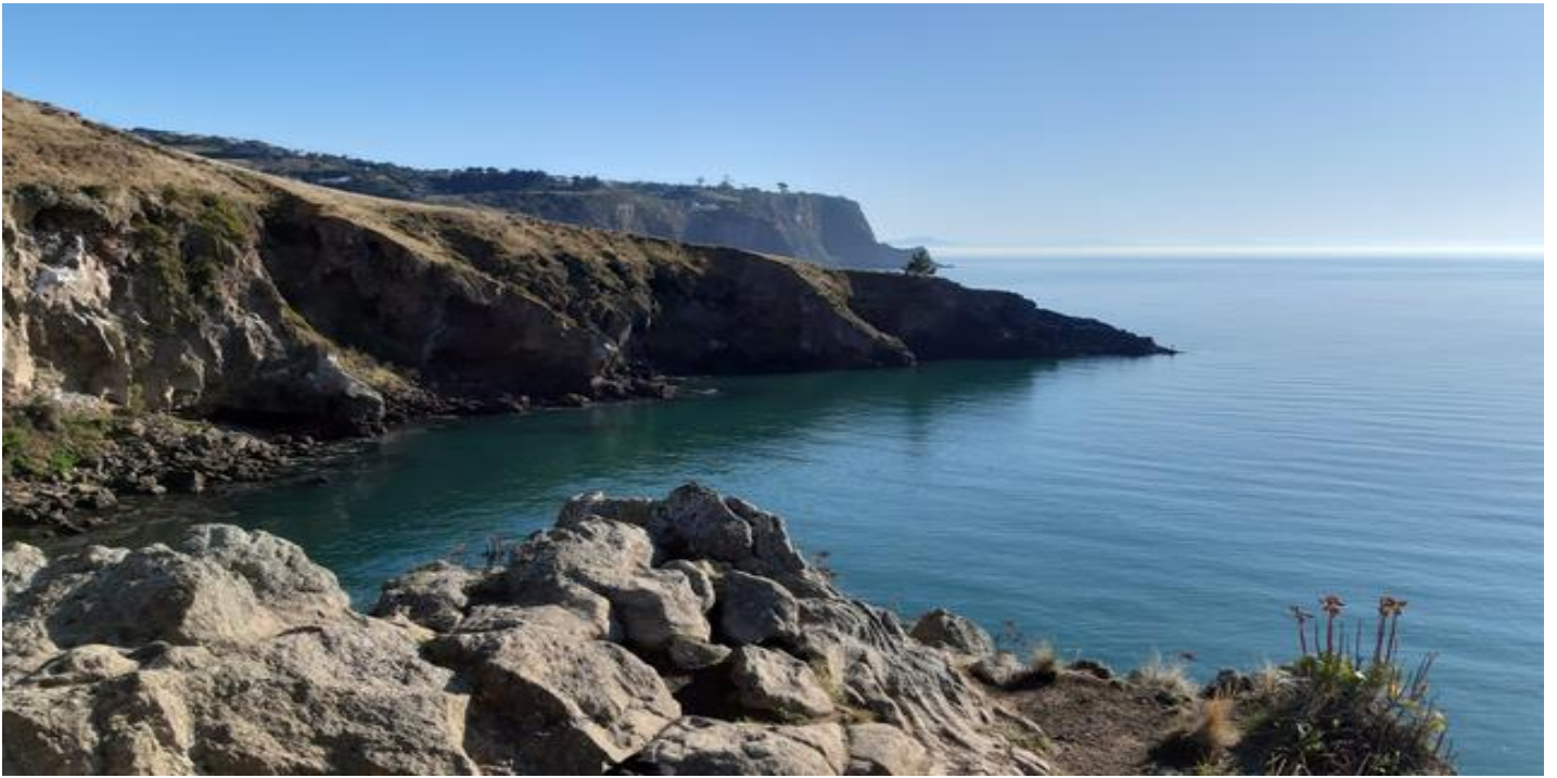
Figure 1. View to Scarborough Head.