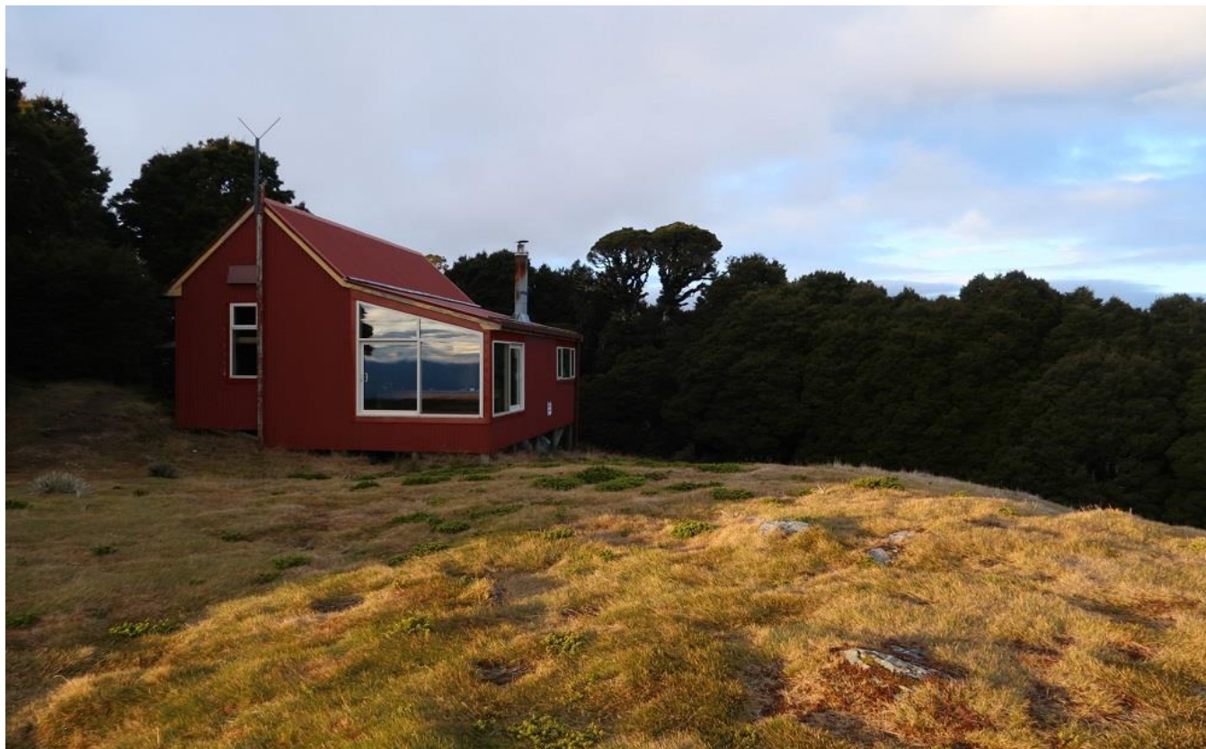
Figure 8. Kirwans Hut in the evening light.