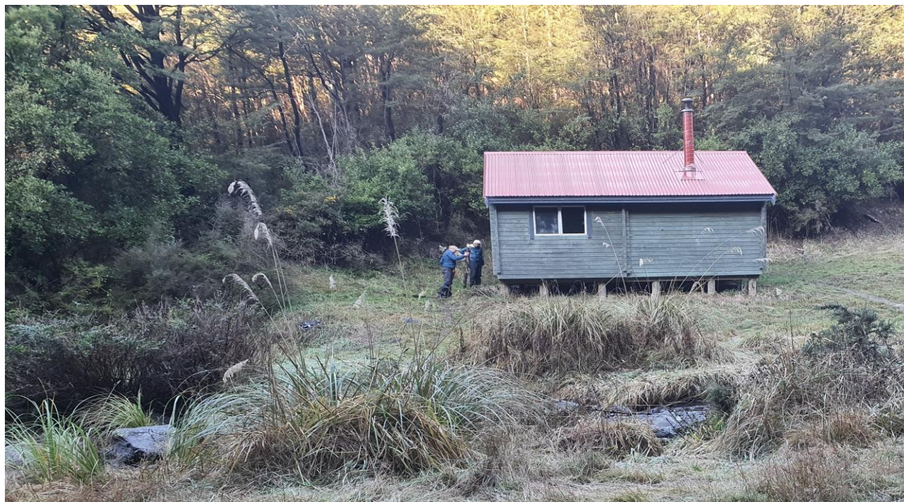
Figure 3. Pinchgut Hut.

The trampers were: Liz Wightwick (leader), Diane Mellish, Dan Pryce, Haroon Sheikh and Ian Wightwick 🏠IW