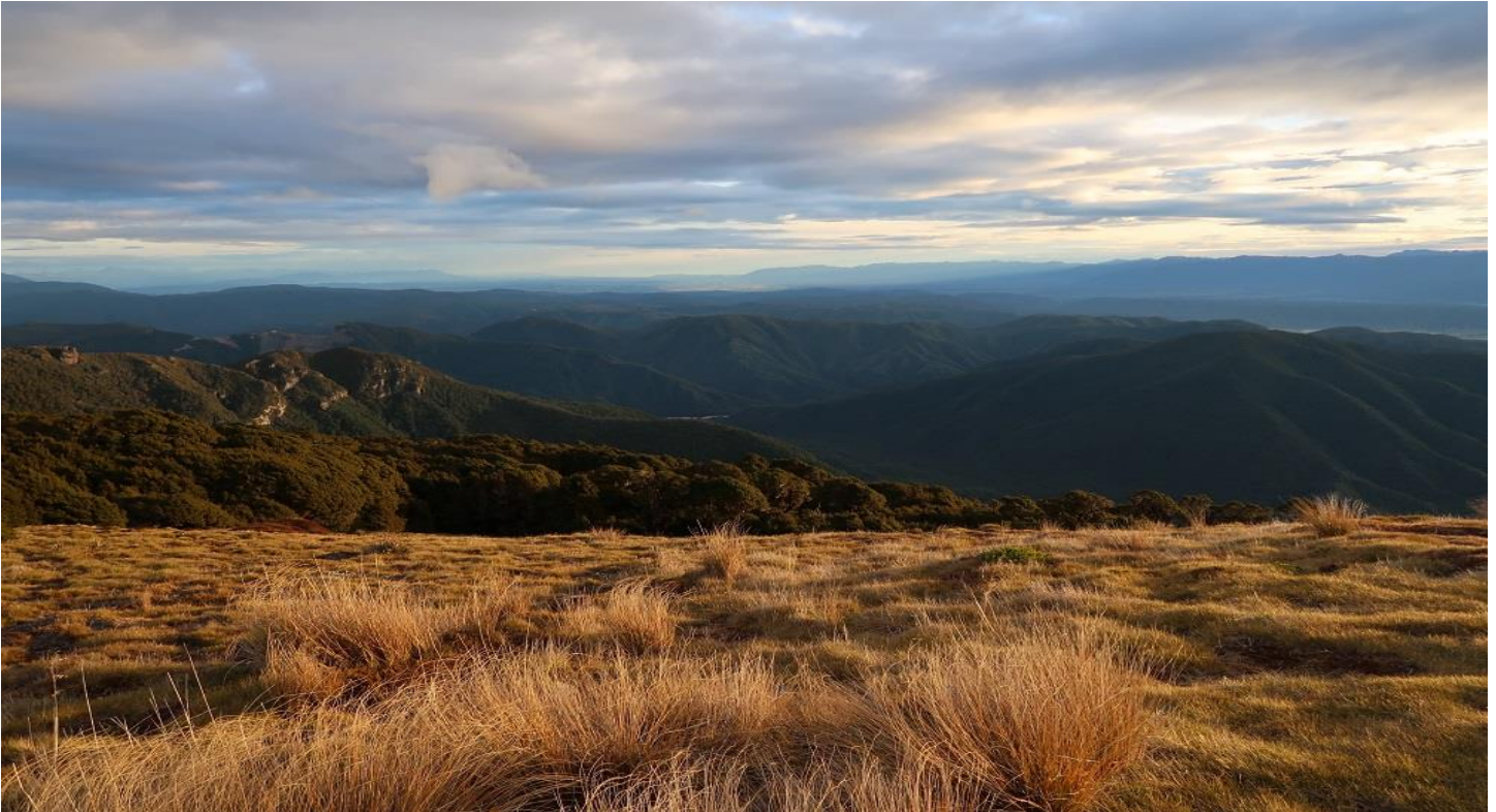
Figure 10. Late afternoon view looking south from Kirwans Hut.