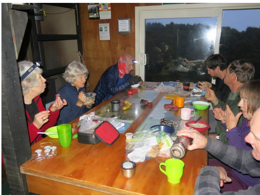
Figure 9. Evening meal Kirwans Hut.

The former mining town of Caplestone, down Boatmans Road, was the trailhead, with a number of former gold and coal mines in the valley. We started in two groups, the Reefton overnighers left in the morning and the rest of us set off just after 11am. The DOC sign said a six-hour trip to the hut.