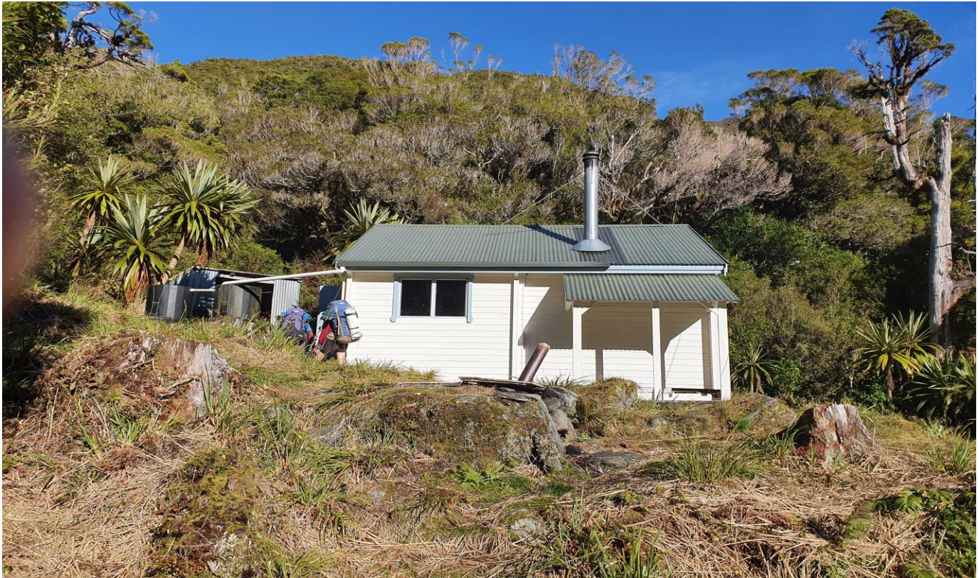
Figure 5. Arriving at Camp Creek Hut.

We arrived at the hut for lunch after a sometimes slippery and steep climb. Four of the six beds already taken. After lunch, Bill, Liz and I climbed up the steep track to the main Alexander ridgeline. A strong cold wind and the short daylight hours mean that we didn't linger too long for the great views.