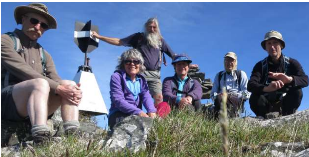
Self-timed from Vesna's mini-tripod