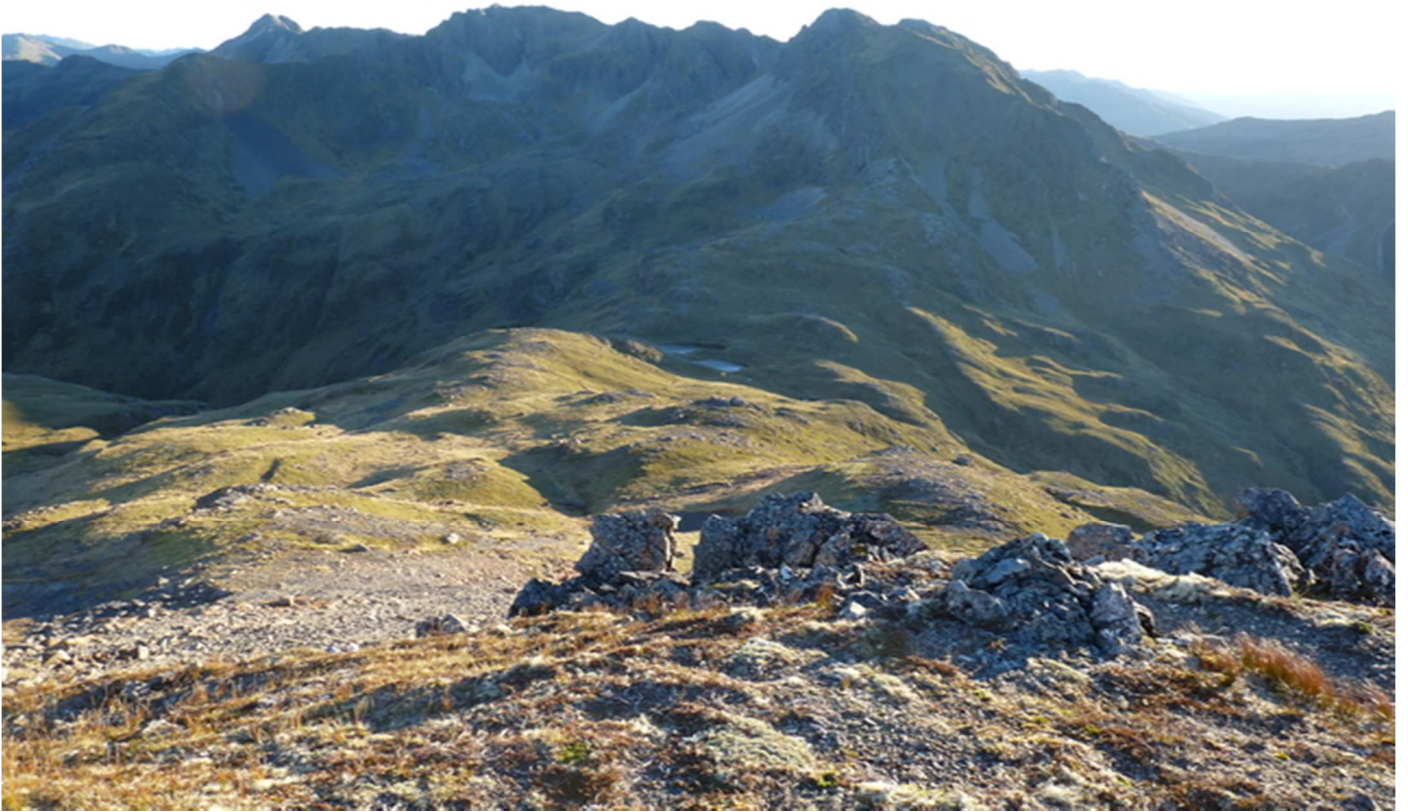
Brass Monkey Biv just visible by the double tarn