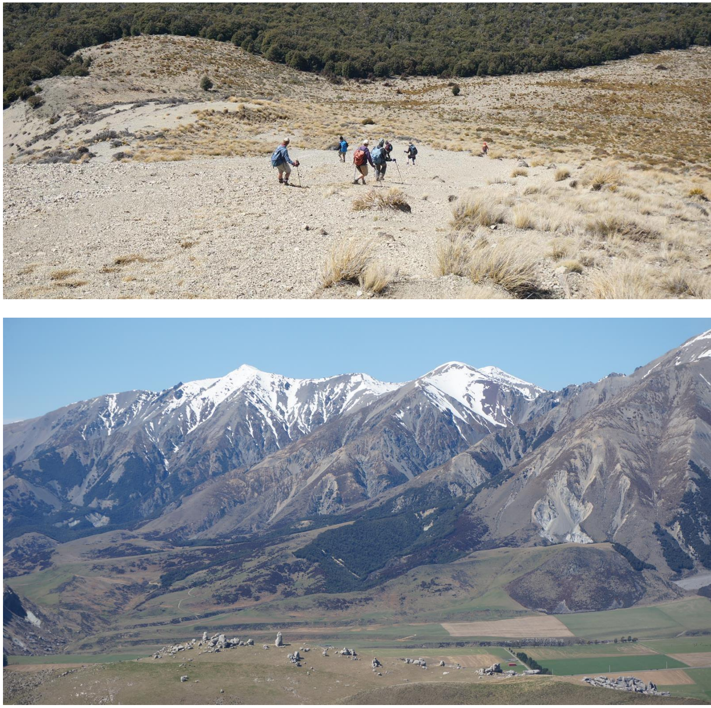
Looking over Castle Hill Station to the high peaks of the Torlesse Range