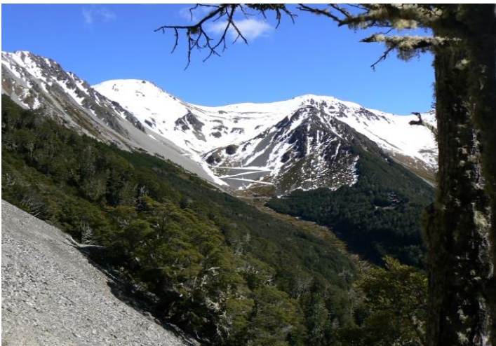
Ski Area, above. Camp Saddle below