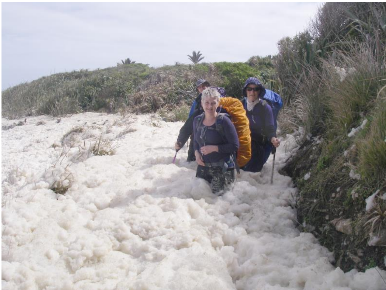
Foaming brine on dry land!