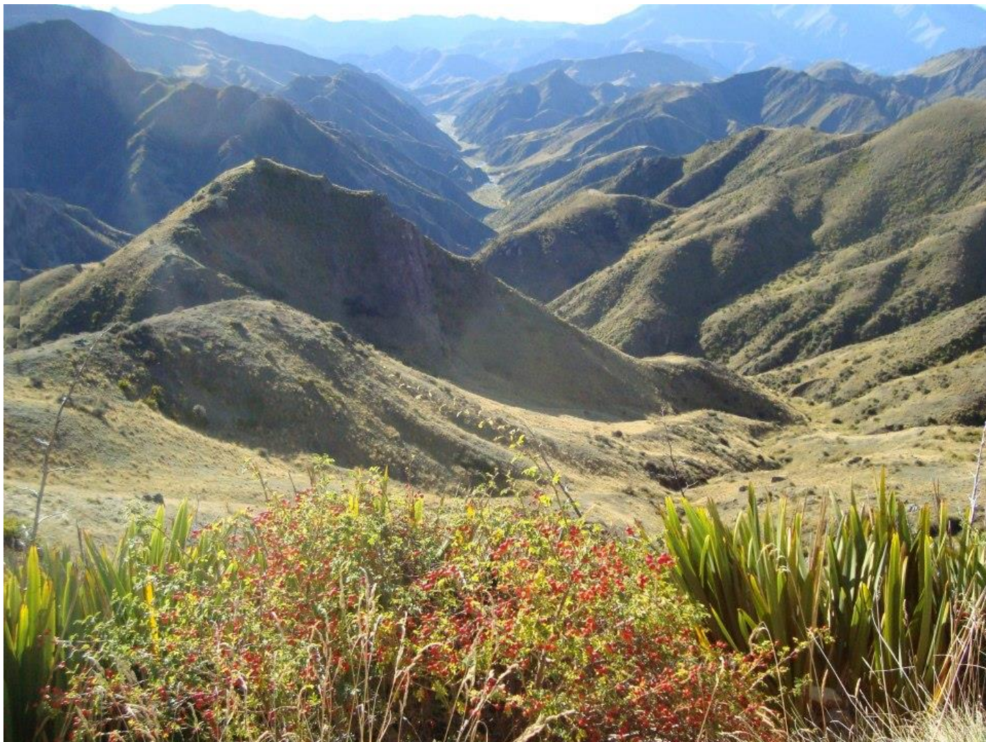
Looking down Seymour Stream.