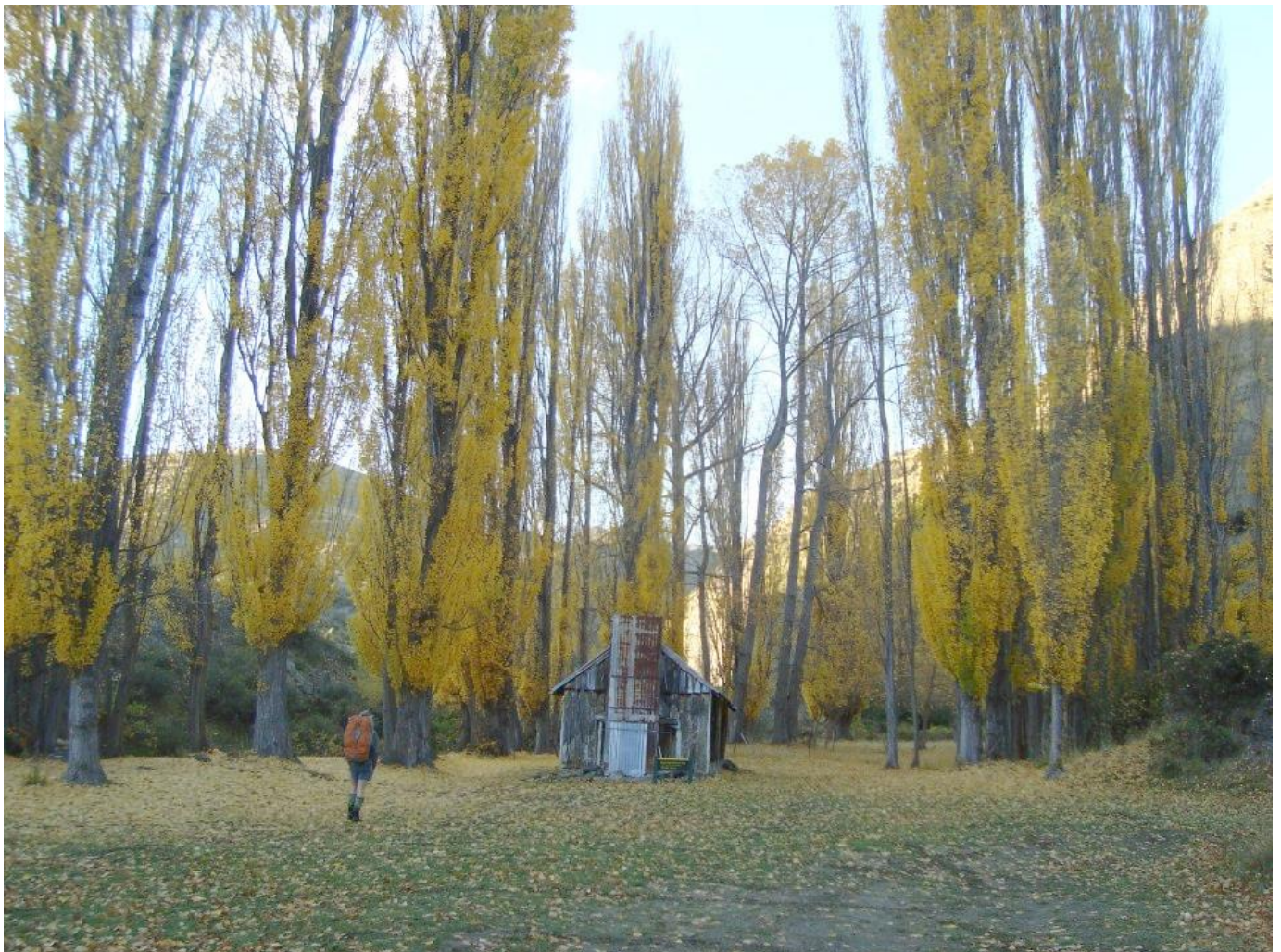
Black Spur Hut—made of slab willow.

http://www.doc.govt.nz/Documents/parks-and-recreation/places-to-visit/nelson-marlborough/clarence-reserve-conservation-area.pdf