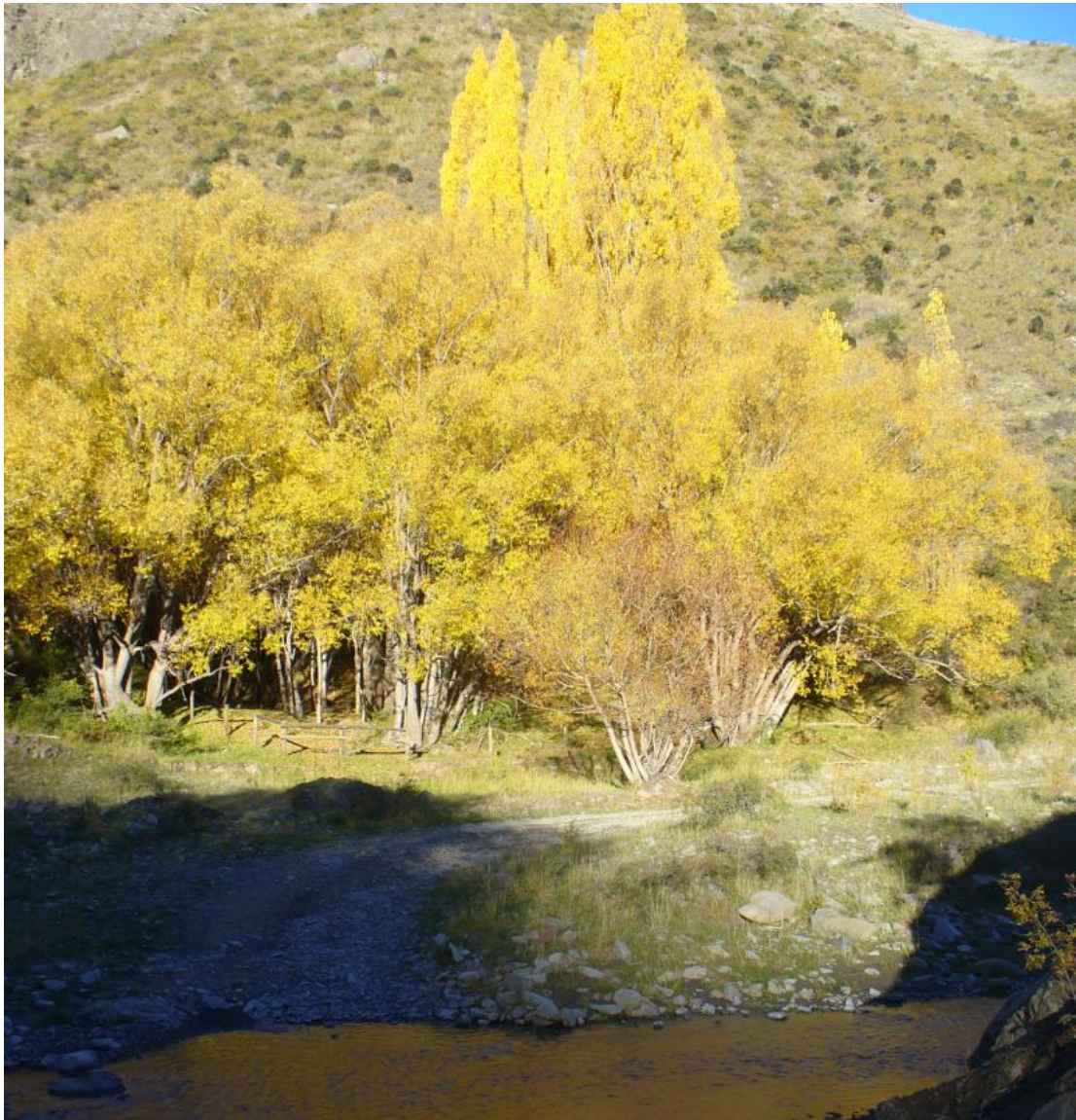
Pig, willows and poplars