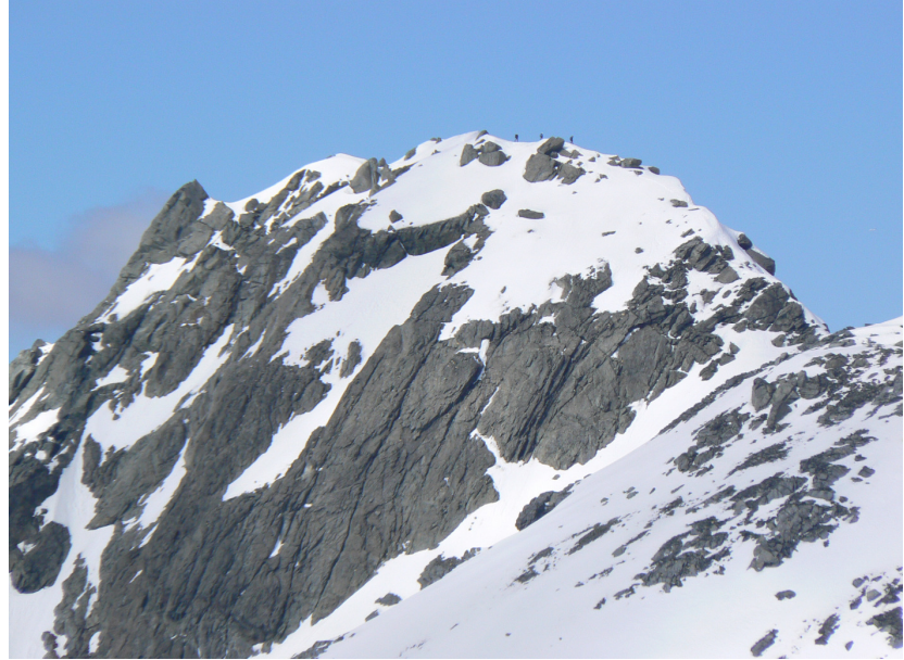
On Fairie Queene