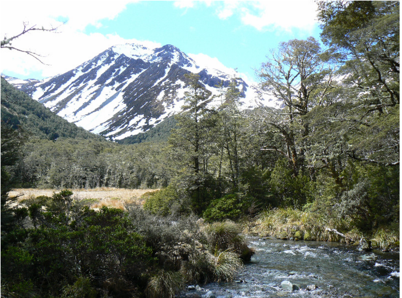
Maruia River near Ada Hut

Day 1: Raymond limited numbers to eight so 2 car-loads headed west at 0700 on the Saturday morning. Cannibal Gorge car park has a bad reputation for car break-in so we'd arranged for a car minder to keep the cars at Boyle Lodge. Rather than wait and feed the sandflies non-drivers headed off on the Cannibal Gorge section of the St James Walkway. Gary nobly stayed at the car park till the drivers came back. We all met up in an hour just before we came upon avalanche snow lying in a stream-bed. We had to walk on hard snow over a snow-bridge then climb off a steep wall of snow to resume the track. Now we had an inkling of why DoC closed the walkway a few weeks back. Numerous signs tell walkers not to loiter in avalanche zones. We stopped for lunch in warm sun at a picnic table outside Cannibal Gorge Hut then walked on another hour and took a break at Ada Hut. When we got opposite Camera Gully we left the walkway, headed through beech forest, crossed the winding Ada River and headed through denser trees then alongside the respectable gully stream. When we emerged into scrub and tussock we looked around for tent space and found adequate sites for four Minarets. It was now 5pm on a mild afternoon and we made ourselves comfortable. 🏕️ KM To be continued.